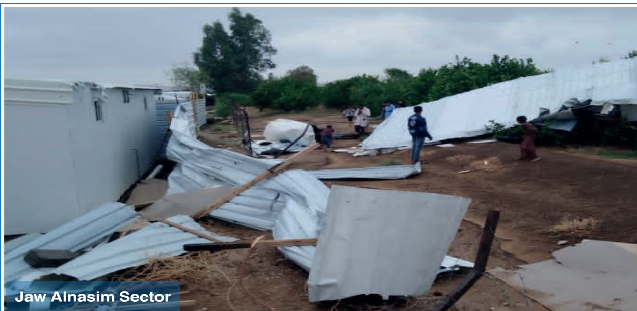
Jaw Alnasim Sector

Heavy rain fell accompanied by severe storms that continued to fall for hours, accompanied by a large flow of torrential rains from the mountains and valleys of Serwah District, causing damage to hundreds of houses, including shelter and food supplies. These families live in difficult humanitarian conditions, which have resulted in severe damage. The floods have cut off roads, and large parts of the camps and gatherings of families have turned into swamps and lakes of water in all districts, as the type of shelter affected is (emergency shelter - temporary shelter - nests - containers - nets - Mud houses) that do not have the ability to withstand changes and fluctuations in the climate in the Ma'rib governorate, and if these rains and torrential flows continue, the situation may worsen and get worse.