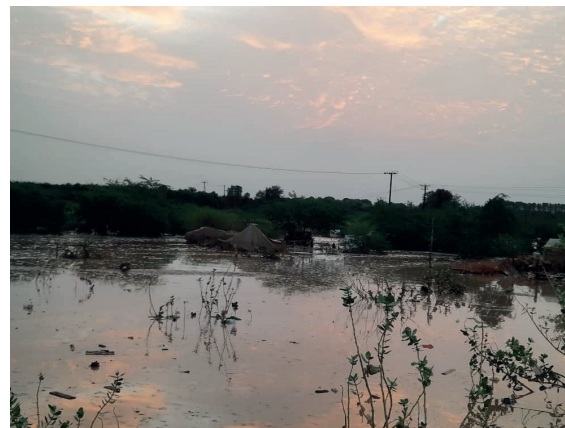
Masna'a Adhban Camp - Marib City Directorate

The total number of totally affected families