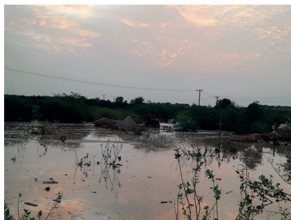
Masna'a Adhban Camp - Marib City Directorate

The total number of totally affected families